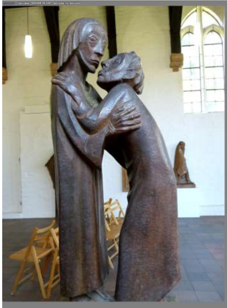
Reunion - Thomas and Christ 1926 Barlach, Ernst, 1870-1938