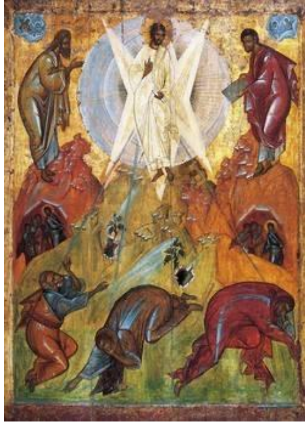
15th century painting by Theophanes the Greek.