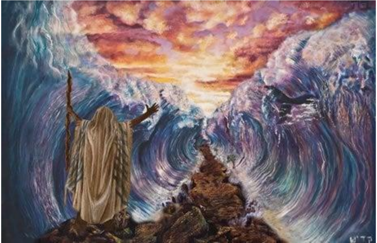
Depiction of Moses Splitting the Sea. (Art by Natalia Kadish)